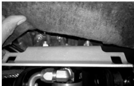
Fig. 4: Passenger side reservoir bracket