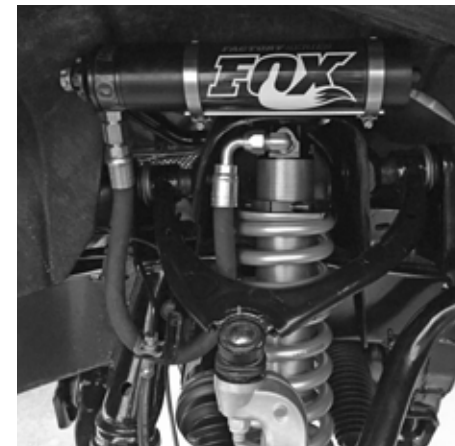
Fig. 2: Passenger side