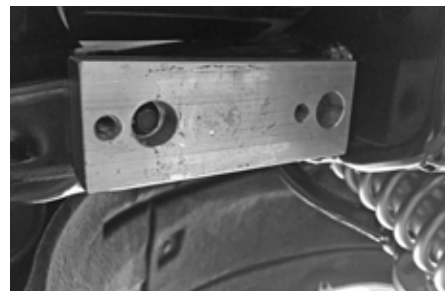
Fig. 6: Passenger side sway bar relocation spacer

sure that the hoses are facing outward and towards the rear of the vehicle (Fig. 2). Make sure to route reservoir and hose under the brake line bracket as shown (Fig. 3). For remote reservoir models, install supplied reservoir brackets onto shock hat studs as shown (Fig. 4).