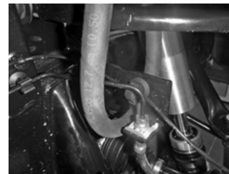
Fig. 3: Passenger side hose routing