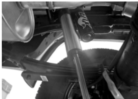
Fig. 7: Passenger side

by law, this warranty expires one (1) year from the date of the original FOX suspension product retail purchase from an authorized FOX dealer or from a FOX authorized Original Equipment Manufacturer where FOX suspension is included as original equipment on a purchased vehicle. If law requires a warranty duration of greater than one (1) year, then, subject to the other provisions hereof, this warranty will expire at the end of the minimum warranty period required by such law.