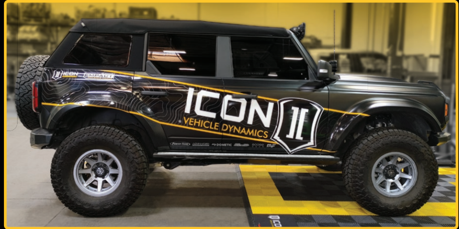
IMAGE SHOWN WITH OVERLAND SPRING INSTALLED WITH NO ADDITIONAL WEIGHT